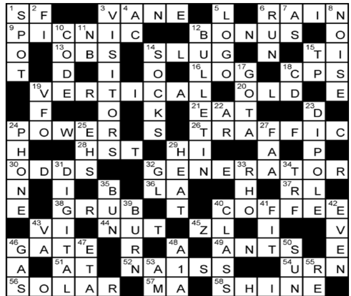
Answers to last months puzzle