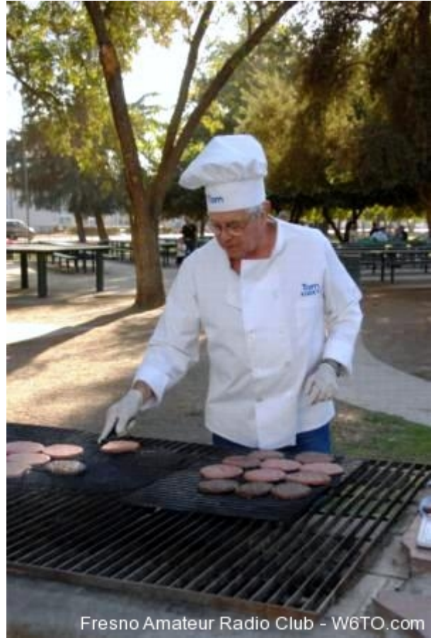
Fresno Amateur Radio Club - W6TO.com