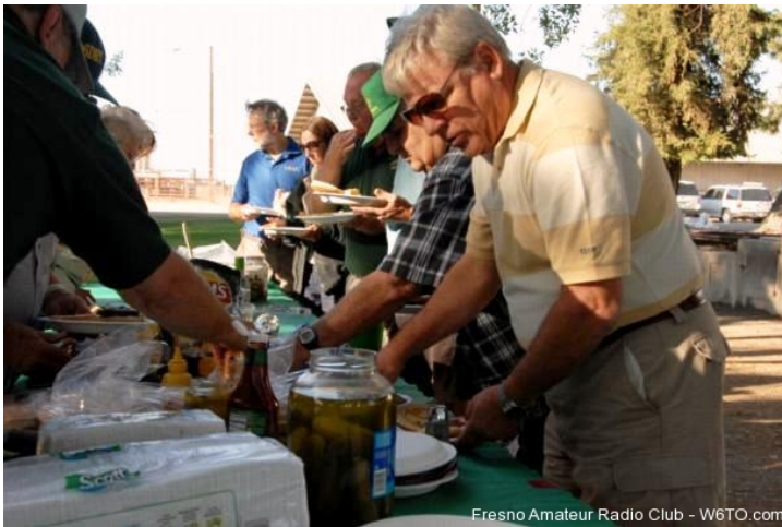
Fresno Amateur Radio Club - W6TO.com

Some of the people that showed up at the picnic. We had a nice crowd, good food and a fun round of bingo. Thanks to all that came and to all the prizes that were donated. Great time by all.