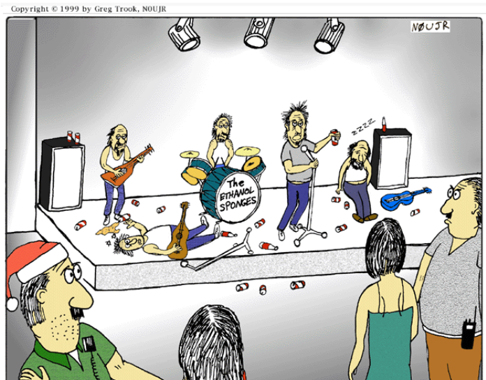
This years FARC Christmas party was not as enjoyable do to poor band conditions.