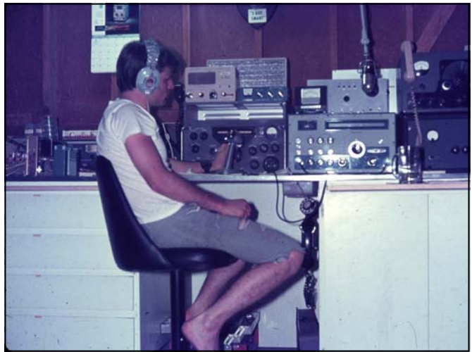
No shoes, no socks, but the best gear around!