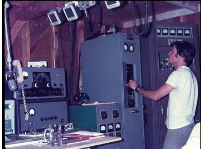
Oh no, which knob was that again?

His other hobbies that include private aircraft, playing golf and teaching flying.