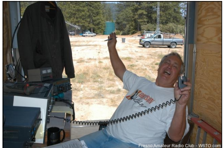
I did it the Soviets just answered! Как у Вас дела?