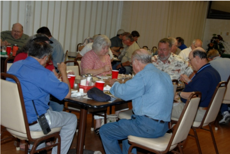
Some of the lunch crowd.