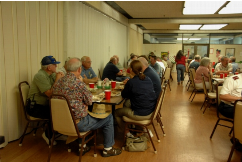
More of the lunch crowd enjoying the good food!