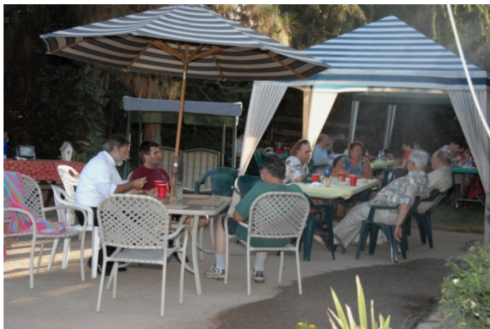
A content bunch after a fine meal