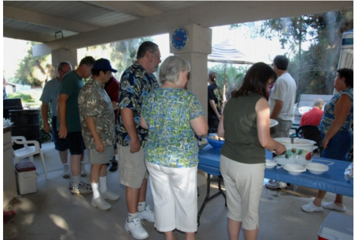
The chow line is filling up