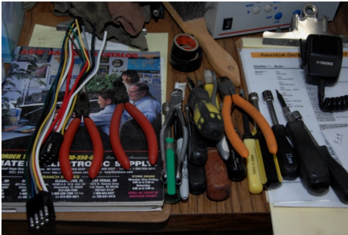
Kens barbeque tools