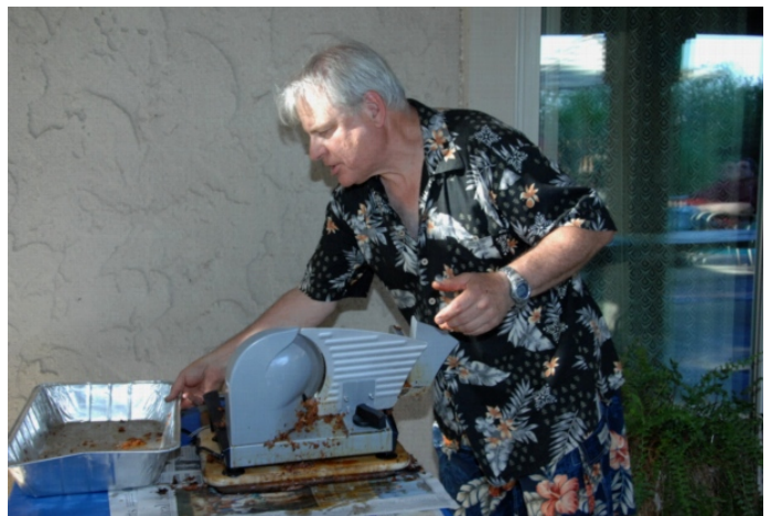
Now what happened to my finger?