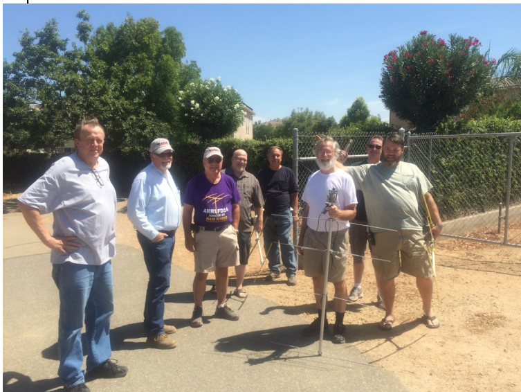
The July 2015 Tx Hunters at the finish line