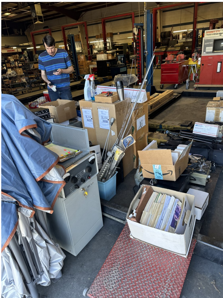
Top left and clockwise