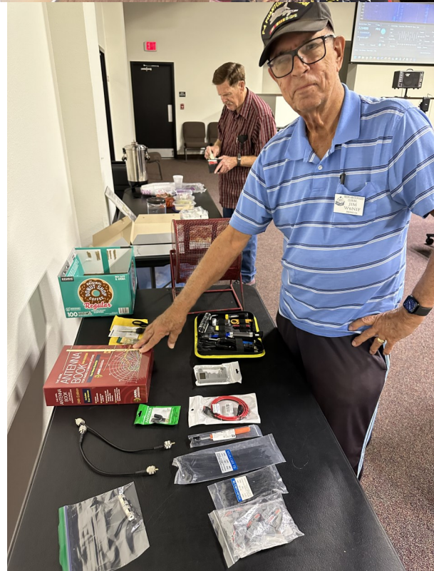
Items not sold at the estate sale. They will be available at the Nov. Swap Meet.