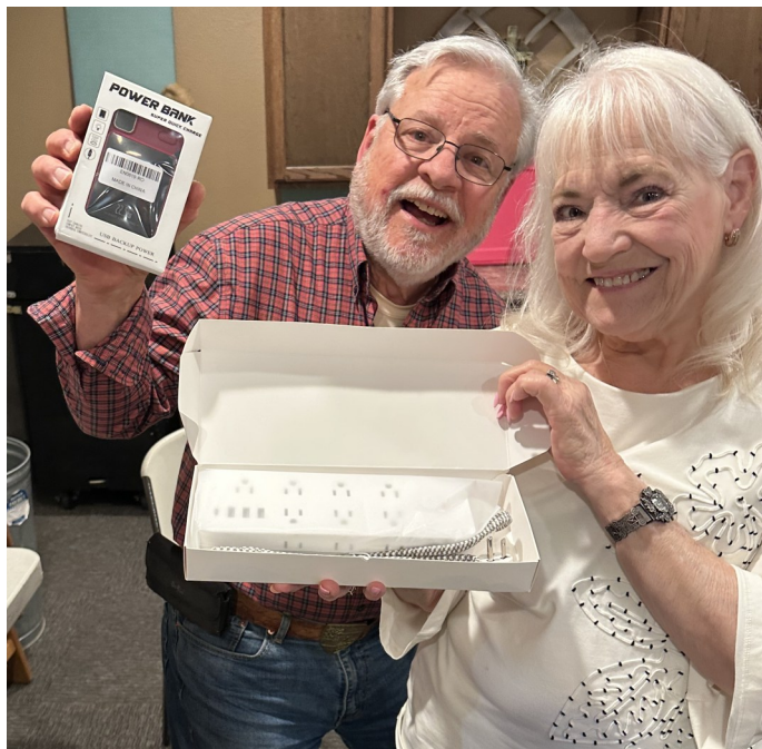
Our first drawing of the raffle prizes.